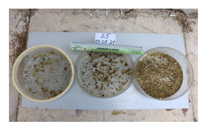
Figure 1. Image of residue left in three sieves of the Nasco Digestion Analyzer after washing the faeces

The study results showed that the average percentages for the CON, T1 and T2 groups were 14.31, 18.10, 13.98, 25.66, 26.80, 19.92, and 60.03, 55.10, 66.09% in the 1<sup>st</sup>, 2<sup>nd</sup> and 3<sup>rd</sup> sieve, respectively (Figure 1). The differences between the groups was found to be insignificant in the 1<sup>st</sup> and 3<sup>rd</sup> sieve, while in the 2<sup>nd</sup> sieve, a statistically significant difference between the T1 and T2 groups was identified (P < 0.05) (Table 6). The amount of faeces remaining in the upper sieve, with a mesh size of 4.76 mm, of the Nasco Digestion Apparatus was found to be higher than the desired level of <10% (Figure 2).